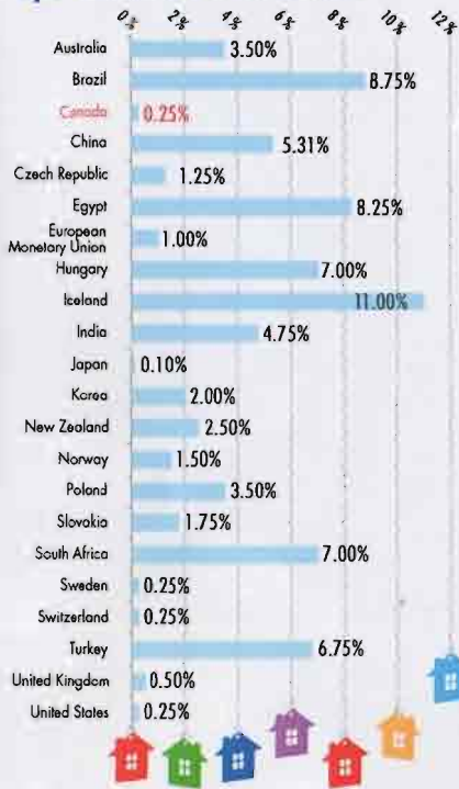
*Central Bank Lending Rates As of November 19, 2009

Today, it seems many countries are aiming to keep their "dollar" low and that should keep their interest rates low as well. Higher rates will attract foreign investment and there goes the "dollar" – up!